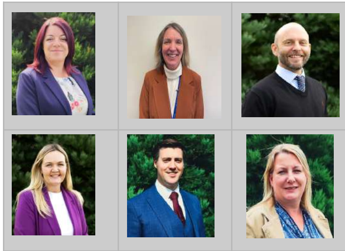
The Senior Leadership Team