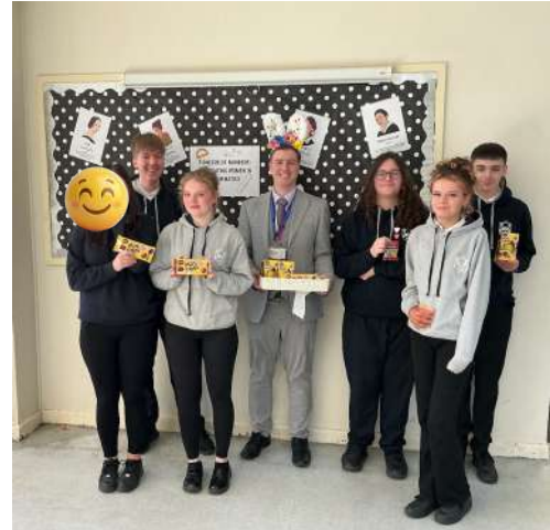
Year 11 topping the leaderboard for Sparx revel in their success with the 'Easter Sparx Bunny'

Well done to all our top Sparx students! With record numbers of students reaching 100% completion this half term the number of prizes has more than doubled! Year 11 are currently taking the top spot, with Year 7 a close second place.