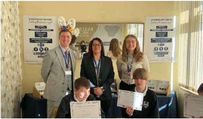
Top Readers breakfasting with the Principal

well-earned pride. They were even visited by the Easter Bunny!