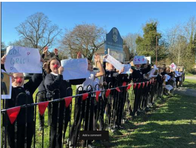
Year 7, in their red noses, wave their banners at Greg James

Our Year 7 students were an absolute credit to the school. They behaved impeccably throughout and represented Barlby High brilliantly, showing enthusiasm, respect, and real pride in being part of the event.